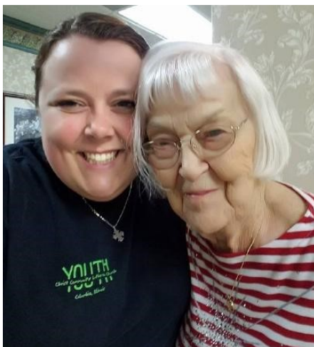
(More pictures are on the board in the belltower hallway)